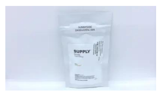
Apr 25, 2025 | Sunnyside

22205 Sw Martin Hwy indiantown, FL, 34956, US