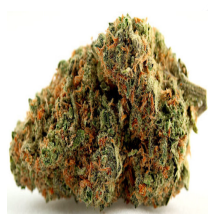
Urine sample container